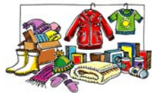
COATS and BLANKETS

We will continue partnering with Flipper Chapel AME Church that has a coats and blankets ministry. If you have coats, jackets,, or blankets in good condition that you can no longer use, bring them to St. Stephen's. You can leave them in the alcove in the parish hall lobby. We will transport them to Flipper Chapel and they will distribute them to people who need them.