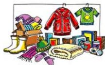
COATS and BLANKETS

We will continue partnering with Flipper Chapel AME Church that has a coats and blankets ministry. If you have coats, jackets,, or blankets in good condition that you can no longer use, bring them to St. Stephen's. You can leave them in the alcove in the parish hall lobby. We will transport them to Flipper Chapel and they will distribute them to people who need them.